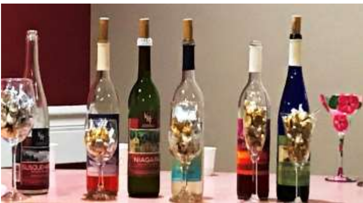
A variety of locally produced wines were sampled; participants had fun sipping and trying to identify the wines, each with its unique combination of flavors..

This program took place at a dinner meeting held at the Ranch House Restaurant, Duncannon. The Grange treated its members to a complimentary meal for the occasion.